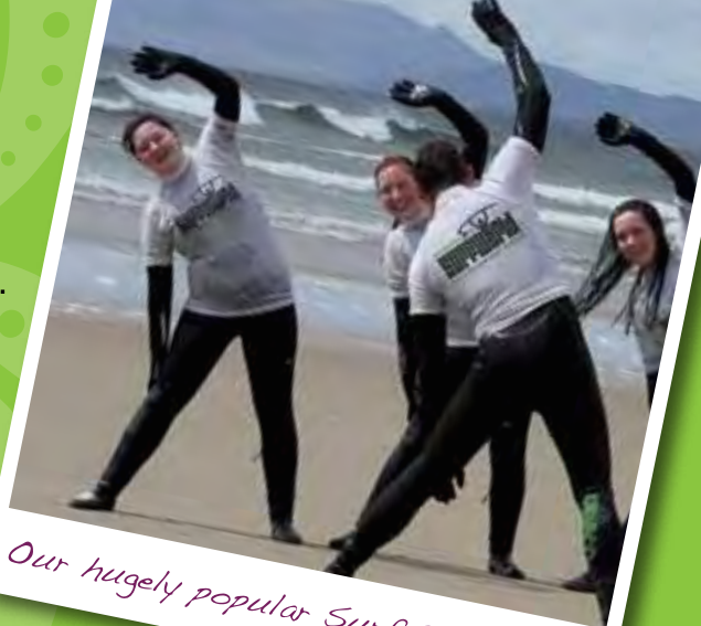
Our hugely popular Surf Bootcamps